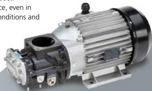
FS 26TFC with highly efficient operation

Routine maintenance parts are easily accessible and simple to replace, ensuring long service intervals and keeping maintenance costs low.